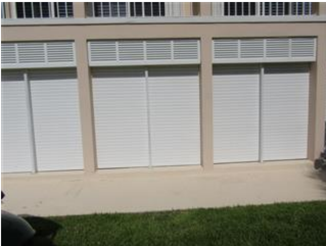
Hurricane Roll Down Shutters - Glass Doors