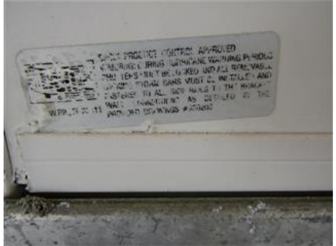
Hurricane Shutters Verification