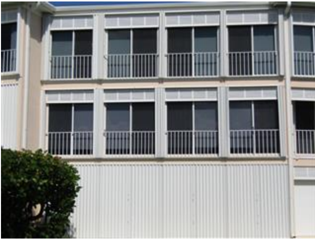
Hurricane Shutters - Glass Doors