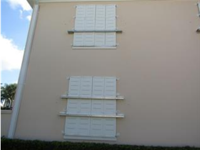
Hurricane Shutters Windows