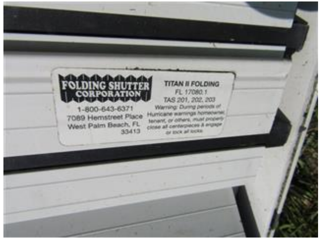
Hurricane Shutters Verification