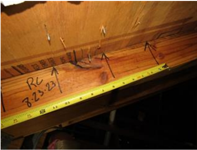
Roof to Deck Connection