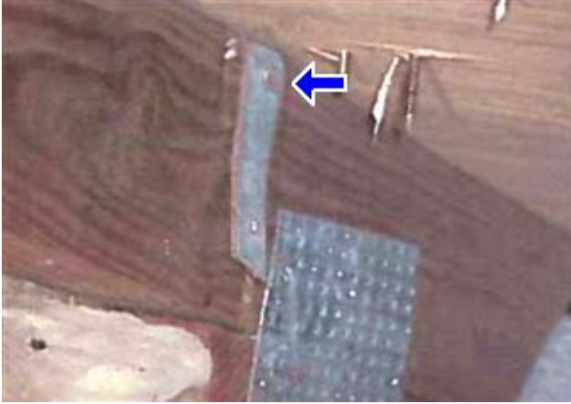
Roof to Wall Connection - Straps (Backside)